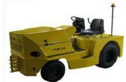
above photos shown with options